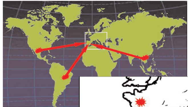
(TOP): Path of Counterfeit Ingredients to Spanish Facility

Authorities disclosed that the ingredients were