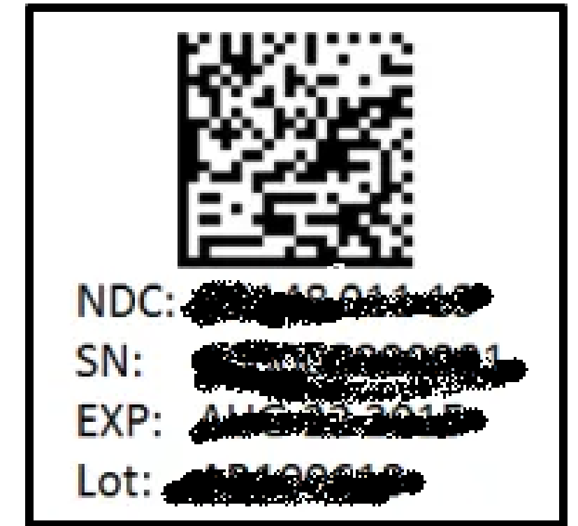
Product Identifier Example