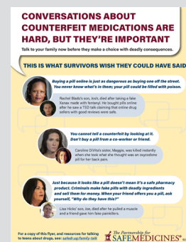
Parent Resource 8.5" x 11" flyer