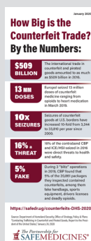
Counterfeit Trade 3.5" x 11" card