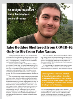
Victims 8.5" x 11" flyer