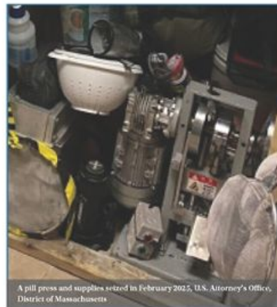
A pill press and supplies seized in February 2025

Follow our open source news feed of ongoing pill press news.